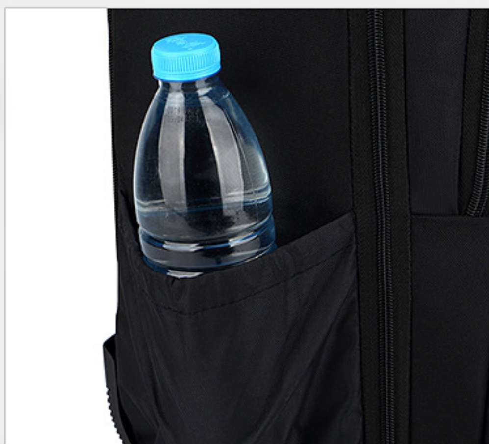
On both sides of the pocket/can hold cups or rain umbrella