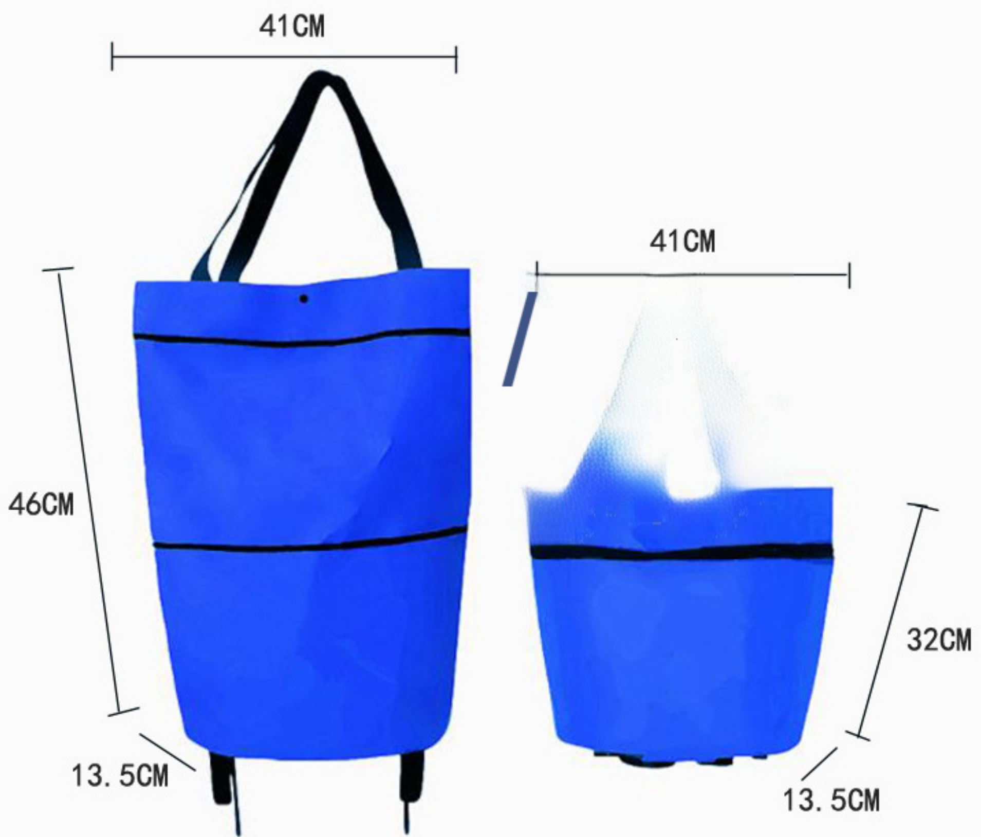
Manual measurement of size, error range within 1-3CM