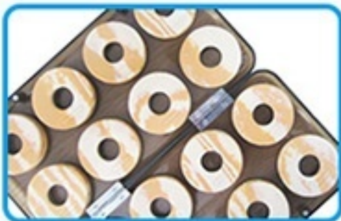
Side-mounted small net pocket can store bait, fishing line box, etc.