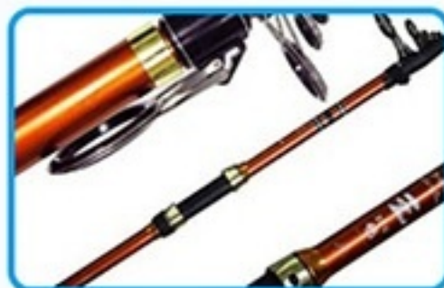
Dozens of fishing rods can be stored in double main bags