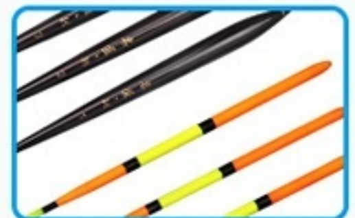
Compartment net pocket can store Float box, etc.