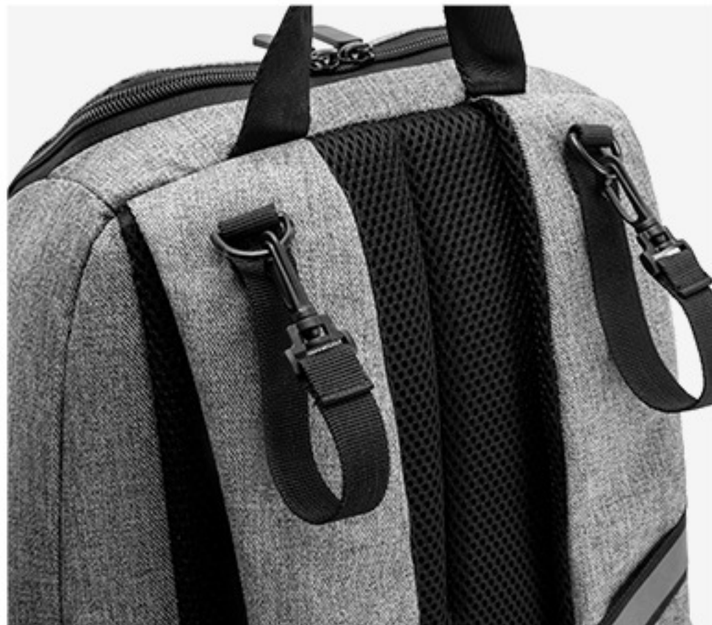
Kids bike hanging buckle