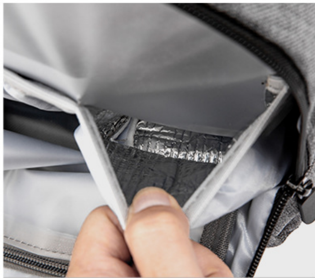
Insulated milk bin