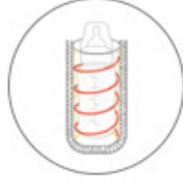
Independent milk bin