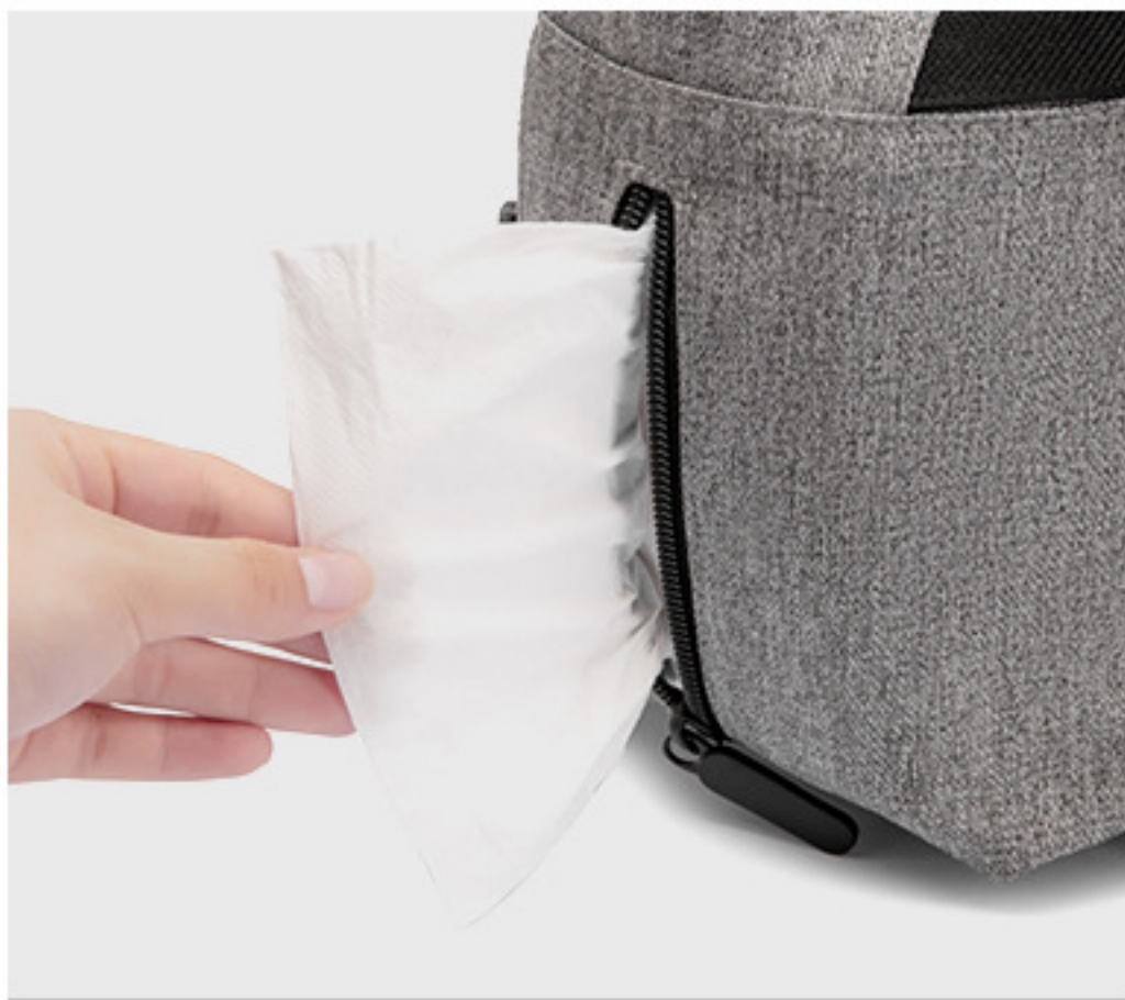
Paper extraction side pocket