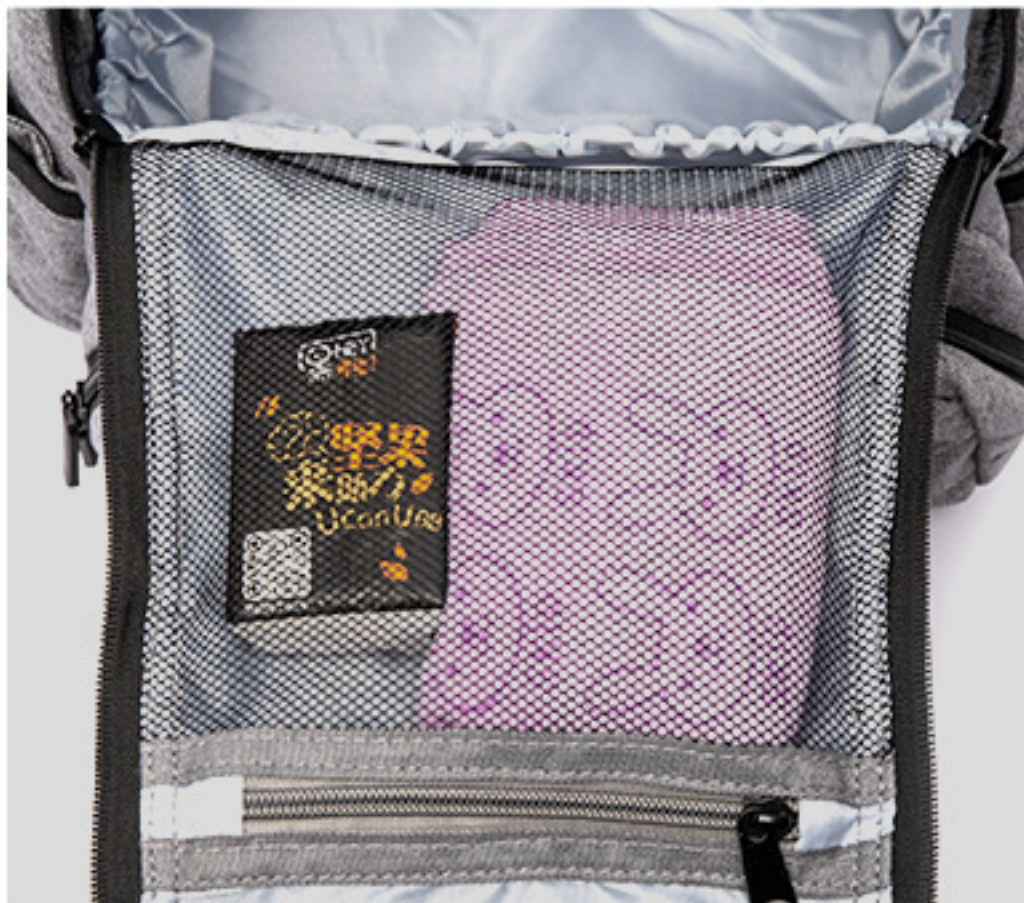
Built-in net pocket