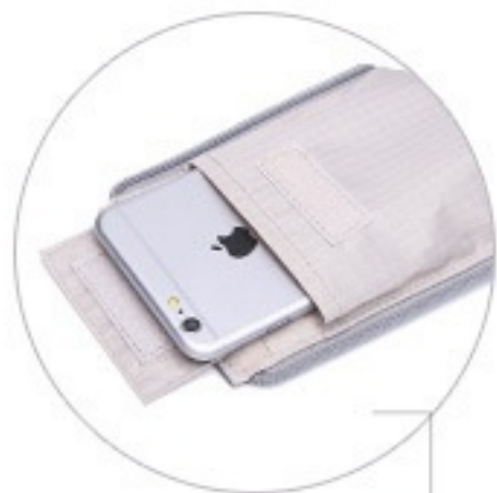
Left mobile phone bag