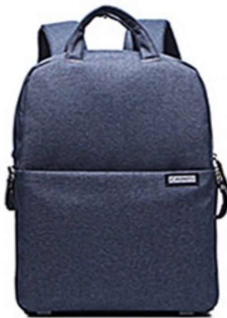
Elegant dark gray