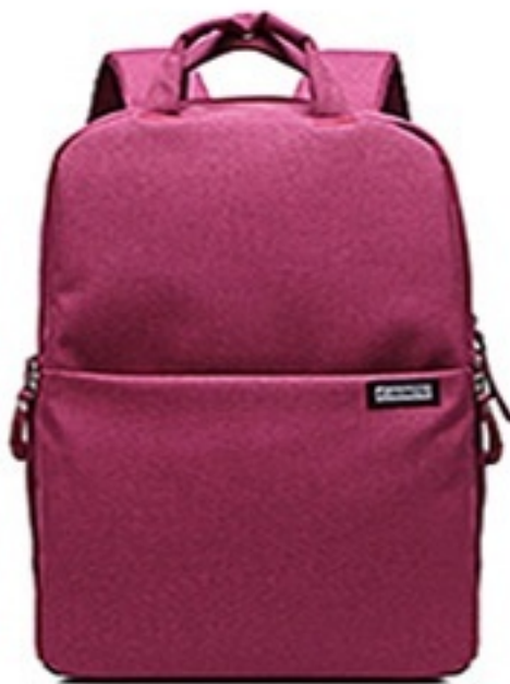
Wine red col- or