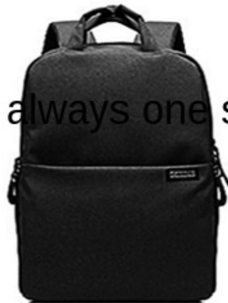
Black Col- or