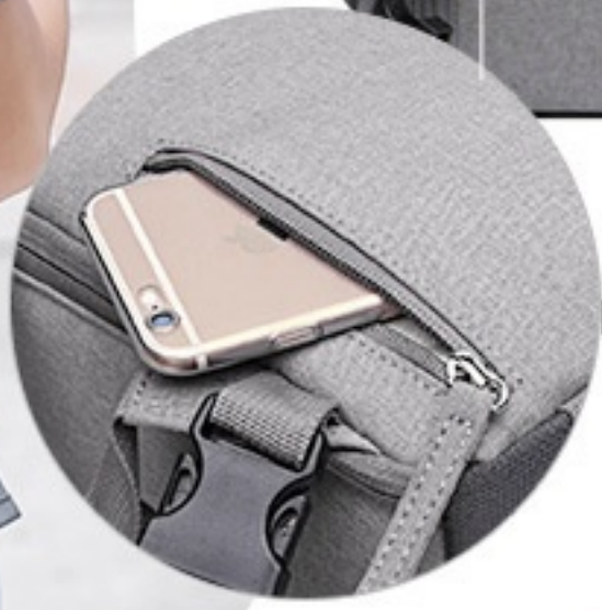
Hidden anti-theft mobile phone bag