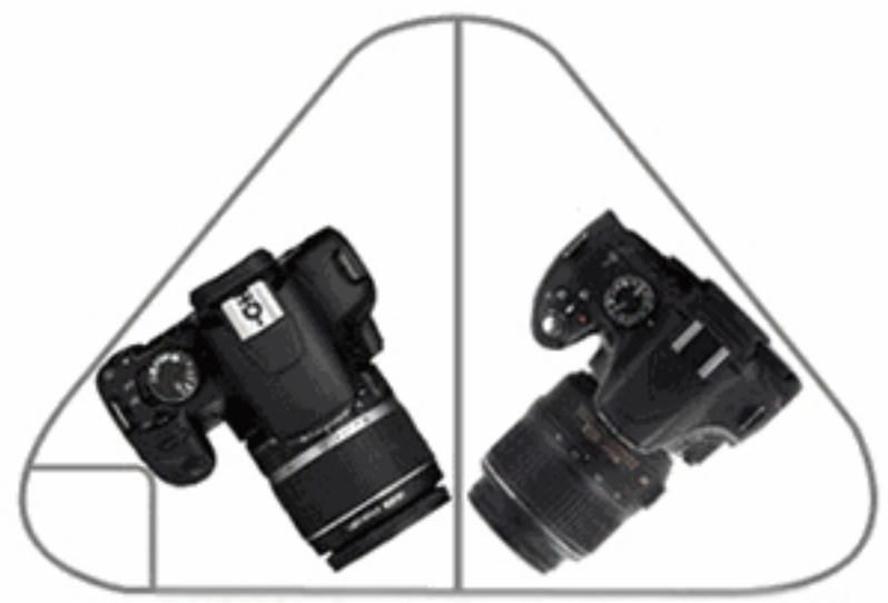
# Canon 550D set Machine + Nikon D5100 set Machine