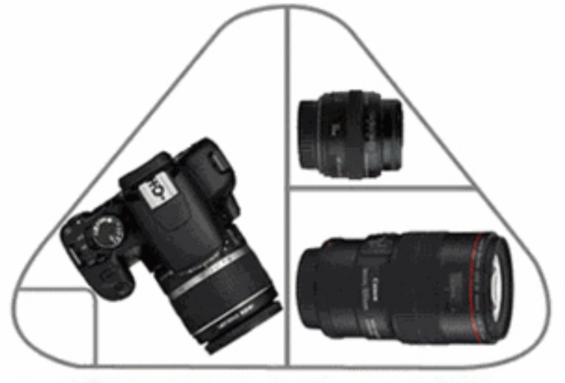
# 550D set + 50MM lens + Canon 100MM lens